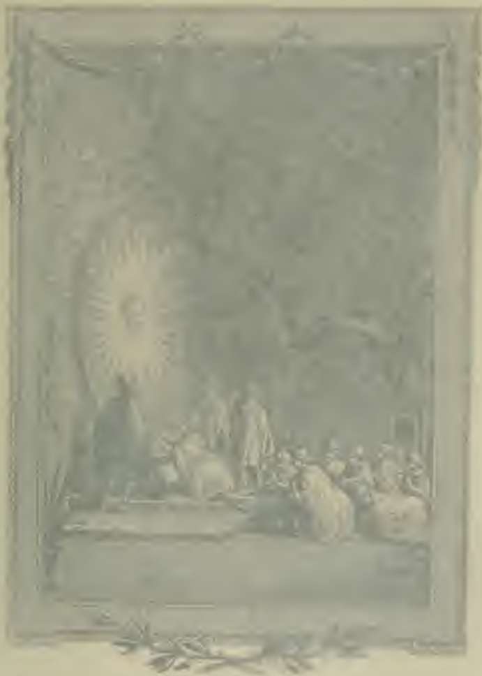
THE TEMPLE OF THE SUN